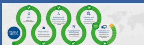
Fig. 3: Current status of the PaedForm project

Further prioritised items will be added as they are completed. Draft monographs for public consultation and final texts will be made available on https://paedform.edqm.eu .